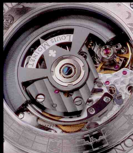
The oscillating weight takes its shape from the sextant, a navigational tool

The overall visual impression, thanks to the difference in scale between the seconds subdial and the chronograph subdials, is that of a vintage two-register chronograph, which lends a dressy and slightly formal air to the neo-Victorian, vaguely steampunk flavor the watch has overall. This genteel touch of machine fetishism is further reinforced by the polished bezel, which